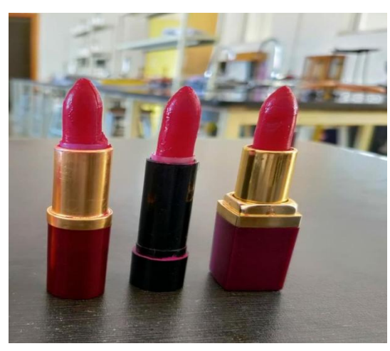
Fig. 2: Herbal Lipstick

Place formulated herbal lipstick in lipstick mould and store it.